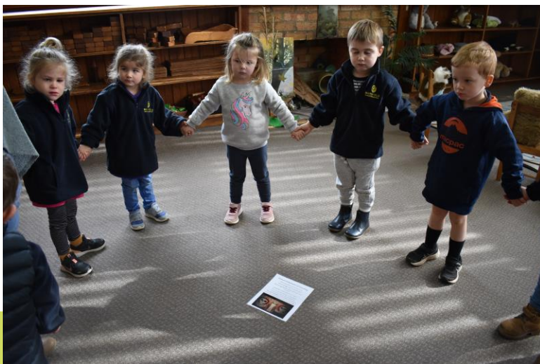
Acknowledgement of country with our 3-year-olds

Equity and Diversity - Early childhood professionals promote cultural awareness in all children, including greater understanding of Aboriginal and Torres Strait Islander ways of knowing and being. VEYLD Framework, 2009